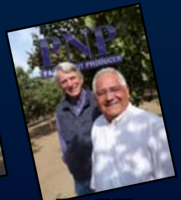
The #1 Western Nut Industry Publication