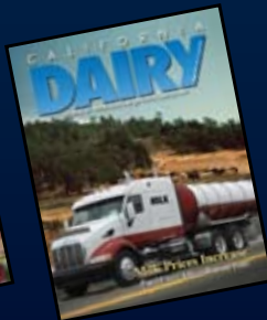
California's #1 Dairy Magazine