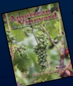
California's #1 Grape Industry Publication

Malcolm Media's Vertical Solutions for reaching your target audience